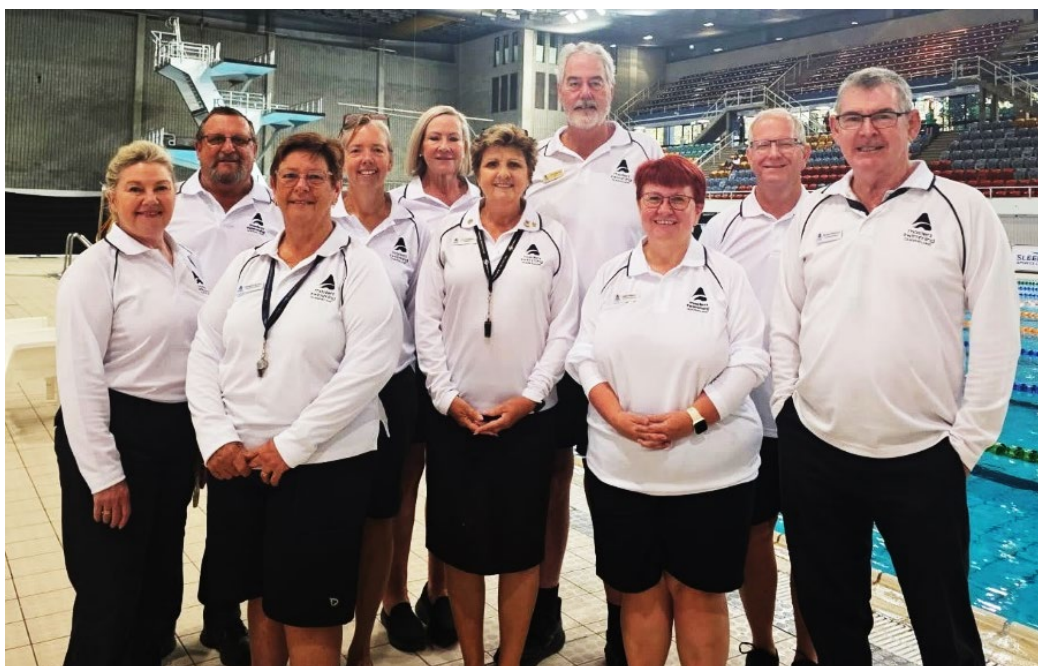
MSQ Officials at the 2025 State LC Championships