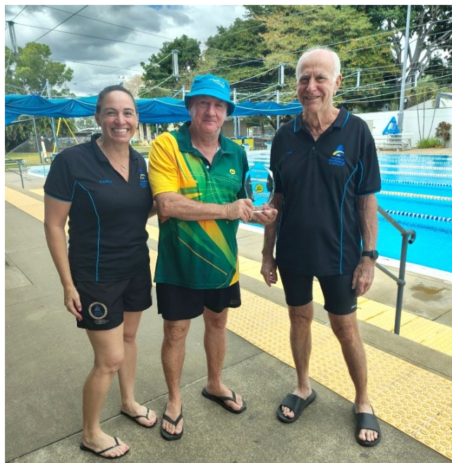
Large Club Award - Long Tan Legends