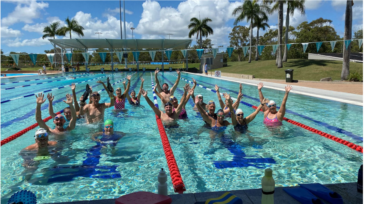
Hervey Bay Masters in action

Common challenges across the CQ region continue to include securing sufficient volunteers to support meet delivery, managing travel costs due to geographical distances, and ensuring timely communication responses from club administrators.