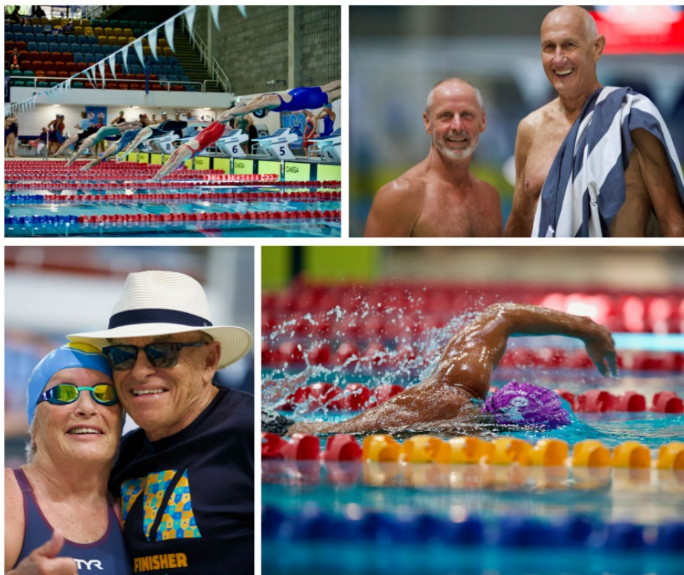
MSQ State LC Championships - Brisbane 2025