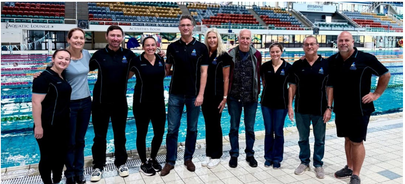
MSQ BMB at the Brisbane Aquatic Centre – June 2025