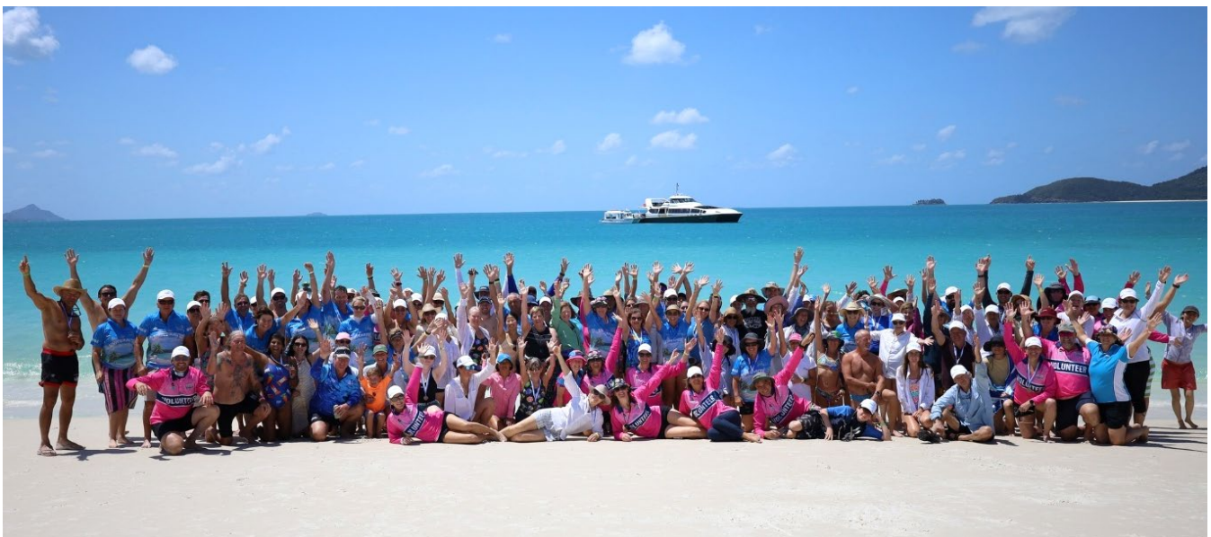
Whitehaven OWS 2025