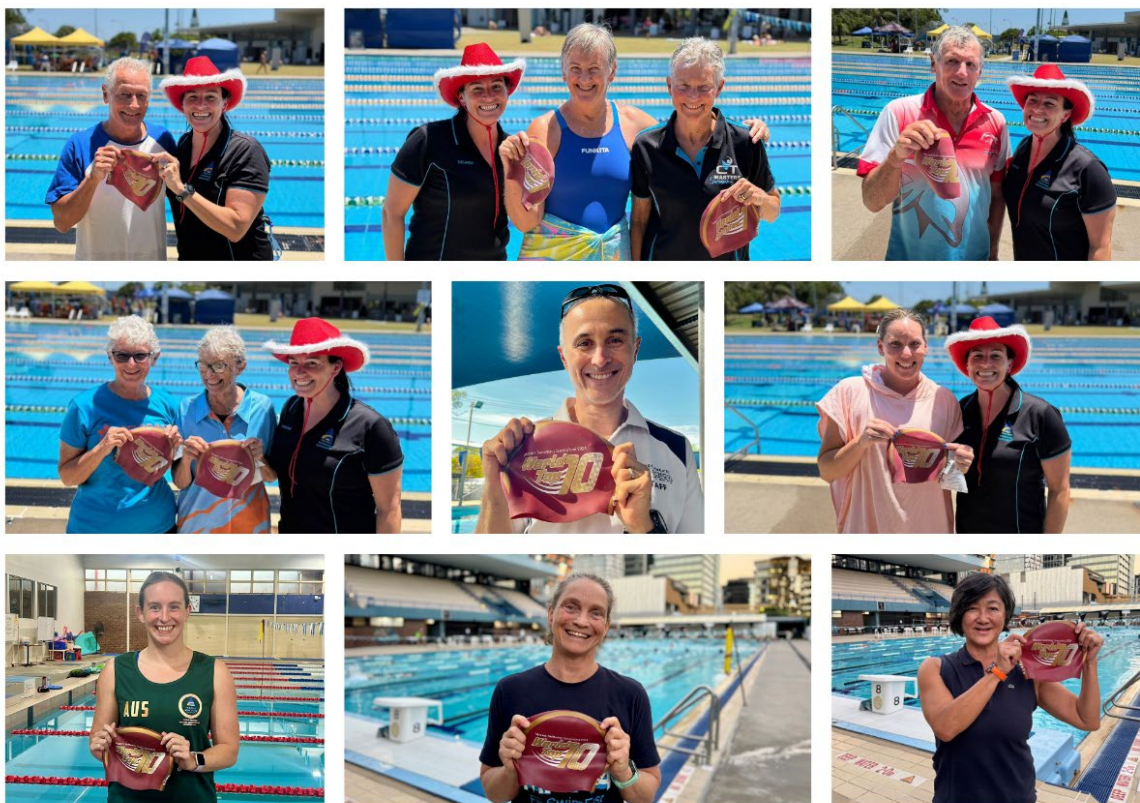
World Top 10 2024 Cap Presentations

Collectively, the 2024 World Top 10 results reinforce Masters Swimming Queensland's continued presence and success on the world stage, celebrating both individual excellence and team achievement across a broad age range.