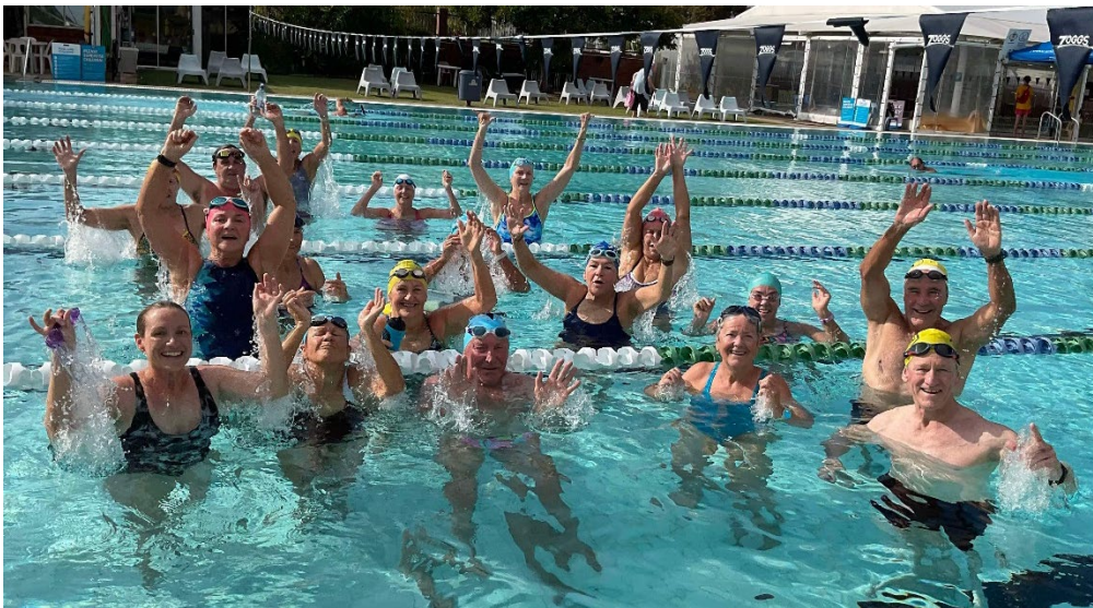
Cotton Tree Masters E1000 swimmers

The 2025 results again highlight the strength, consistency and enthusiasm of Masters swimming across Queensland, with continued growth anticipated in 2026.