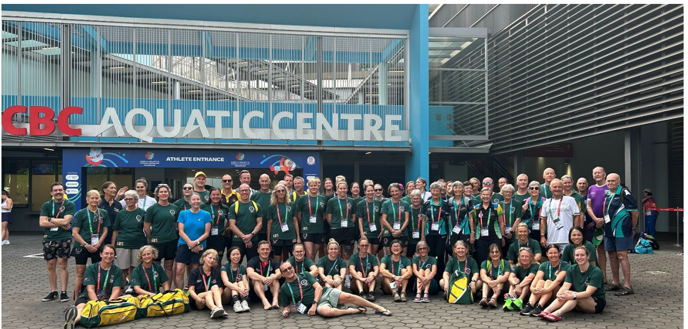
MSA Swimmers in Singapore August 2025

MSQ acknowledges and congratulates all swimmers who represented their clubs, state and country in Singapore, contributing to Australia's success and visibility at the World Aquatics Masters Championships and reinforcing Queensland's reputation for strong participation and performance at international Masters events.