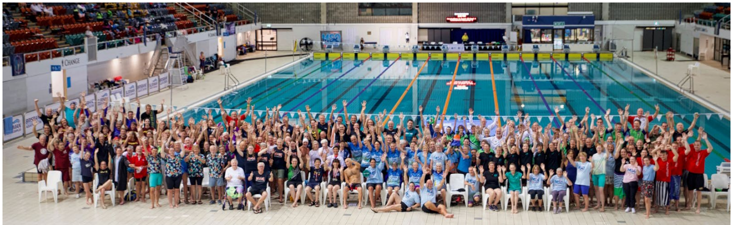
MSQ State SC Championships - Brisbane 2025