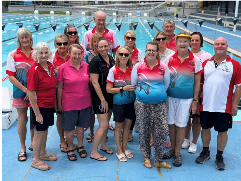
Redlands Bayside Masters

This has been a quieter year in terms of new initiatives, but sometimes the most important work is the work that holds things together — showing up at the World stage to represent Queensland, standing shoulder to shoulder with the Board on a landmark event, and adding a little character to what Masters Swimming means for our members.